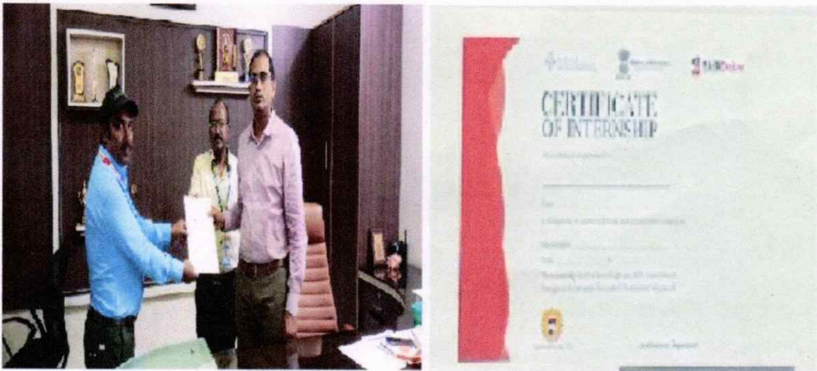
Figure: MoU exchange Between Director,ACEM and SKILLDZIRE officer

The term of this MoU is for a period of 3 years, effective from 08/01/2024. This MoU may be extended upon mutual written agreement. It shall be reviewed annually to ensure the fulfillment of its purpose and necessary revisions.